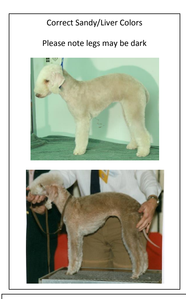
Correct: Dark patches are acceptable.