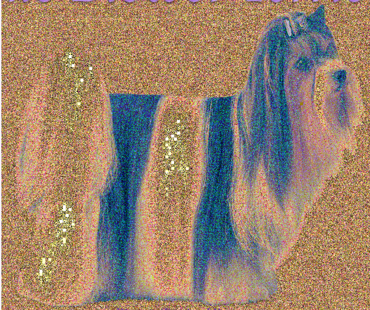
Biewer Terrier History