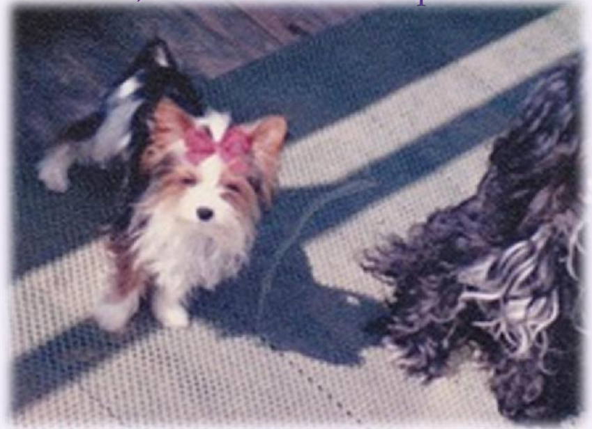
One of the beginning dogs