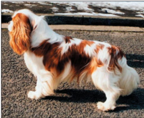
Correct & balanced angulation front and rear

Shoulders well laid back. Forelegs straight and well under the dog with elbows close to the sides. Pasterns strong and feet compact with well-cushioned pads. Dewclaws may be removed.