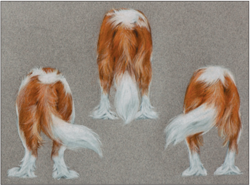
Left—Cow hocked Middle—Correct Right—Bowed hocks

Hindquarters should come down from a good broad pelvis, very slightly sloped to give an attractive tail carriage.