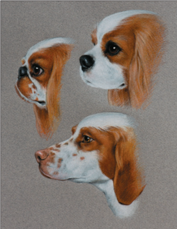
Top: L—R: English Toy, Cavalier Bottom: Brittany

Correct head type is an essential element of the breed. Correct head type is necessary to distinguish Cavaliers from their cousins, English Toy Spaniels. English Toys with their globular heads, short noses and deep stops are the antithesis of the Cavalier Standard and on no account should the two breeds approach similarity in head type. Gentleness and softness of expression must be the key to all the head properties.