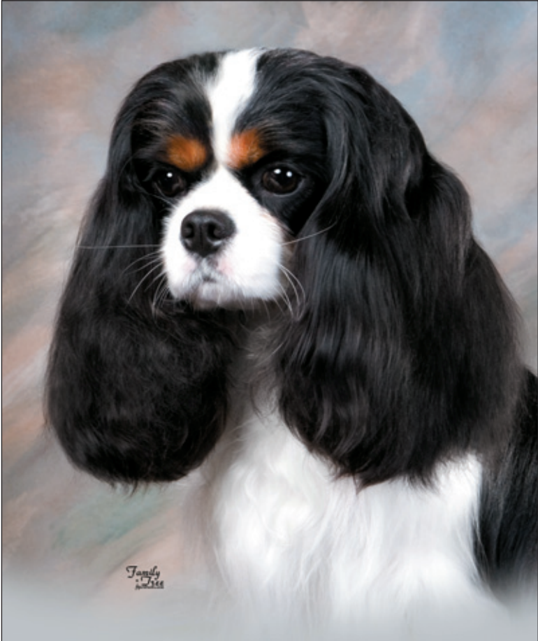
Correct head, ear set, eyes, and muzzle

Soft, sweet, gentle and trusting. No head would be correct without the soft melting expression. This expression is the result of the flat appearing skull and the frontal placement of the large round eyes with slight padding underneath, framed by high-set ears.