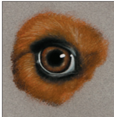
White ring around light eye

The most important feature of the head and, arguably, of the breed, is the eye. Cavalier eyes should be large, round and very dark brown, spaced well apart and looking directly forward. All of the trust and gentleness of the Cavalier's soul is communicated through its lustrous, limpid eyes. A slight cushioning and/or padding ('fill') under the eyes contributes immeasurably to the softness and correctness of expression.