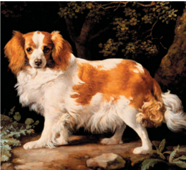
George Stubbs, 1776

The first Cavaliers were sent to America in 1952, and in 1954 a club was formed. Soon after, they sought AKC recognition, but because of their small numbers they were relegated to the Miscellaneous class, where they remained for 17 years. However, in 1993, the American Cavalier King Charles Spaniel Club was formed, and on January 1, 1996 the Cavalier became the 140 th AKC recognized breed.