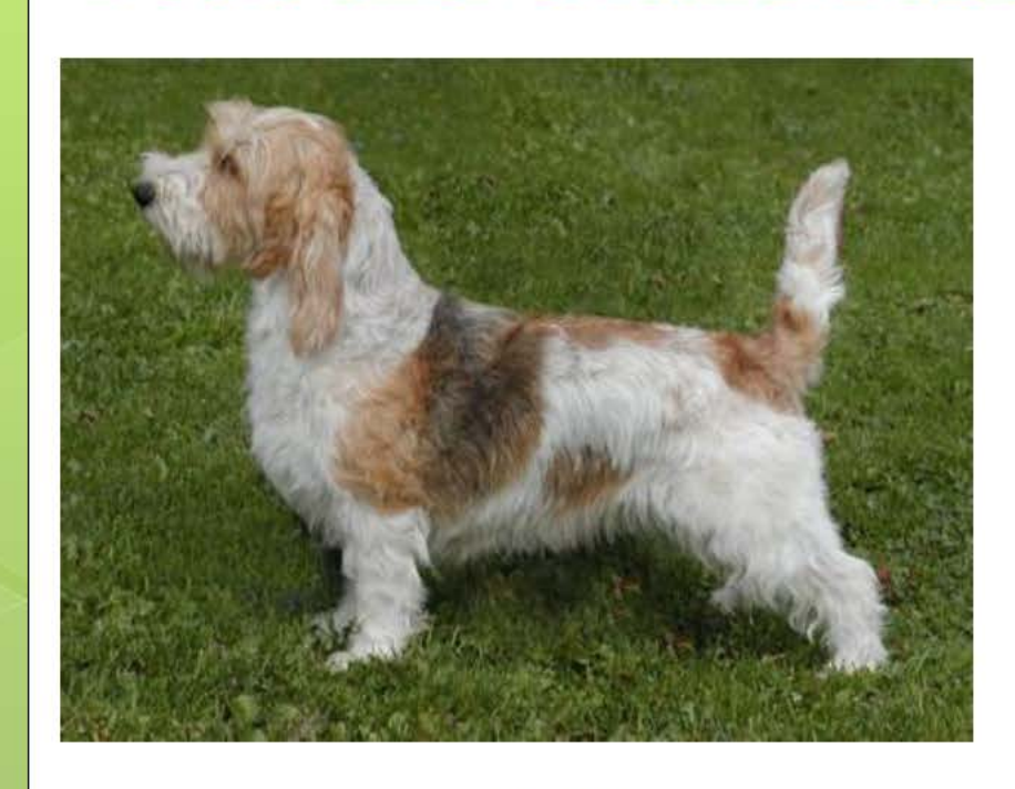
Petit Compact, only slightly longer than tall. shorter tail, shorter ears, shorter muzzle, shorter legs