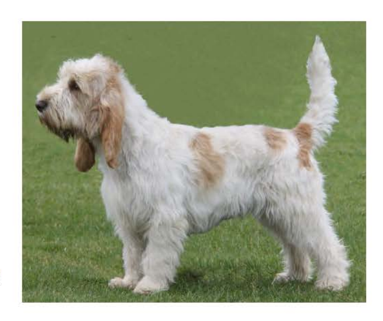
Grand Longer body, longer tail, longer muzzle, longer ears, longer legs.