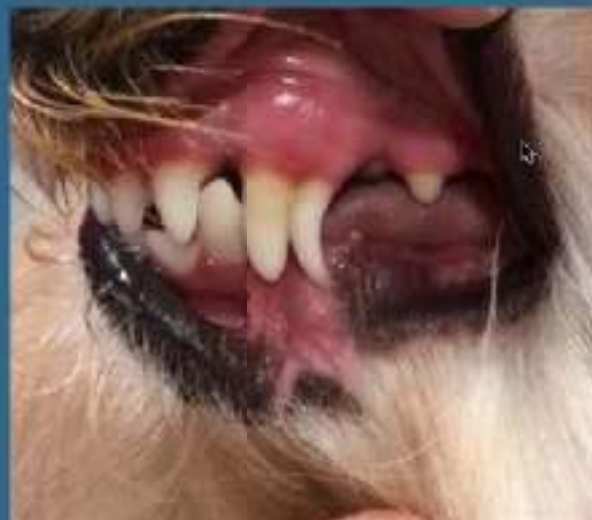
Acceptable depigmentation of lips due to rubbing of canine teeth