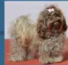
Russian Tsvetnaya Bolonka