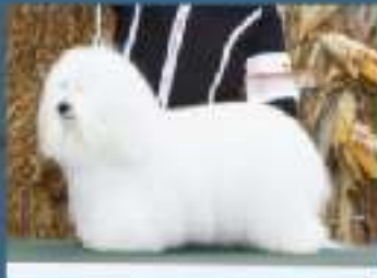
Coton de Tulear